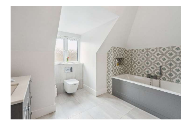
FAMILY BATHROOM with white suite of panel bath, shower attachment, tiled wall surrounds, w.c. with concealed cistern, wash basin with vanity cupboard and drawers, tiled splash back and floor, heated towel rail, extractor fan.