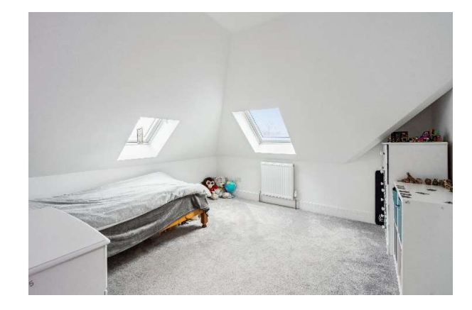
BEDROOM TWO with two Velux roof lights, radiator.